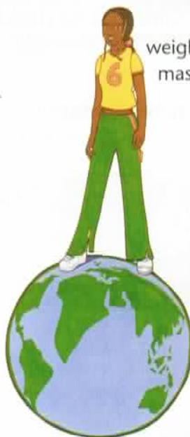
weight 660 N mass 66 kg